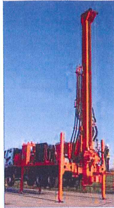
Far left: Dando supplied this bespoke Watertec 12.8 water-well drilling rig to the British Army