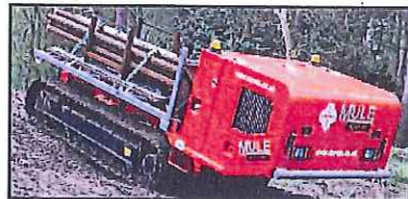
Dando has recently diversified into the tracked utility vehicle market with the launch of the Dando Mule ATV5-RC- a remote control self loading/unloading crawler carrier.

In addition to being awarded numerous local business awards, Dando has won the prestigious Queen's Awards for Enterprise (International Trade) twice. The award is presented annually by Her Majesty The Queen, and only given for the highest levels of excellence demonstrated in each category; a great honor for the company.