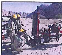
Dando's Terrier is on the job in Namibia.

made to concentrate their efforts on the creation of a range of drill rigs and equipment which became second to none.